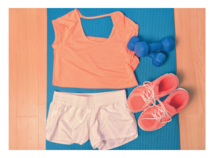
Wear loose-fitting, comfortable clothing for your therapy appointment.

You should try to wear clothing that you can move around in; as if you were going for a walk on the beach or to exercise. Typically, most patients will bring a pair of shorts and shoes to change into but we also have suitable exercise attire at the clinic for those times our patients forget their therapy gear.