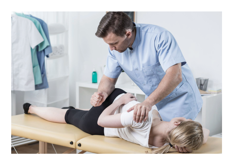
Physical therapists can help relieve muscle, nerve, and joint pain as well as stifness from a variety of conditions and injuries.