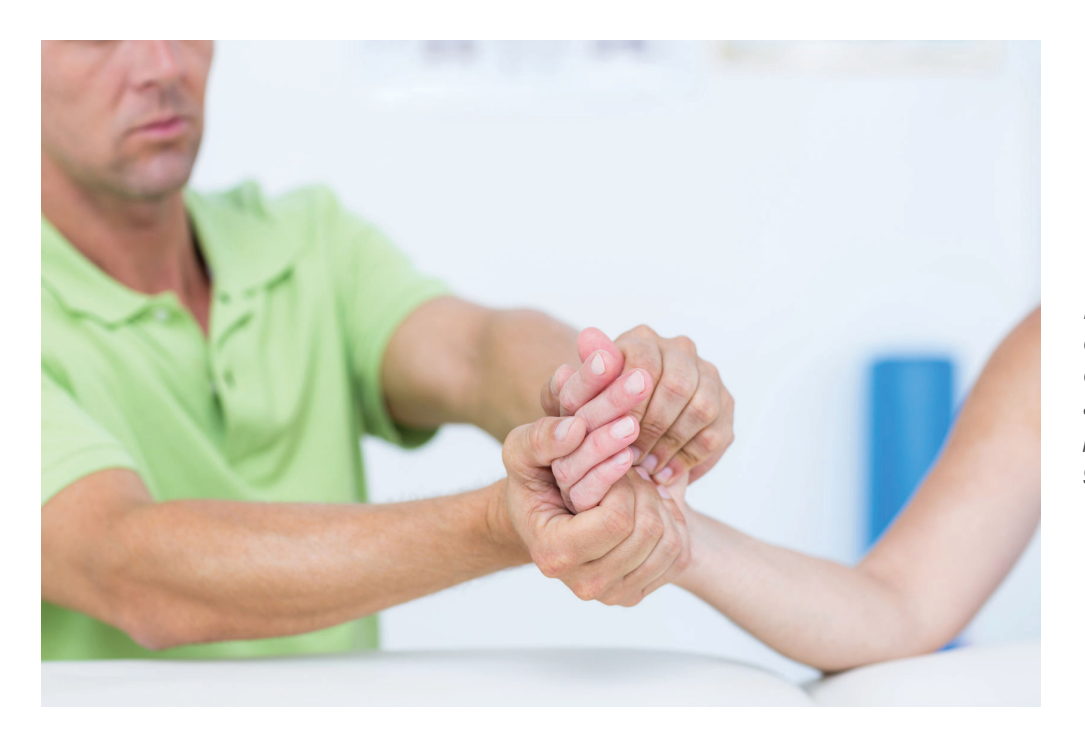
Physical therapy can not only help in the treatment of joints infamed by arthritis, it can help prevent arthritis pain from getting worse.