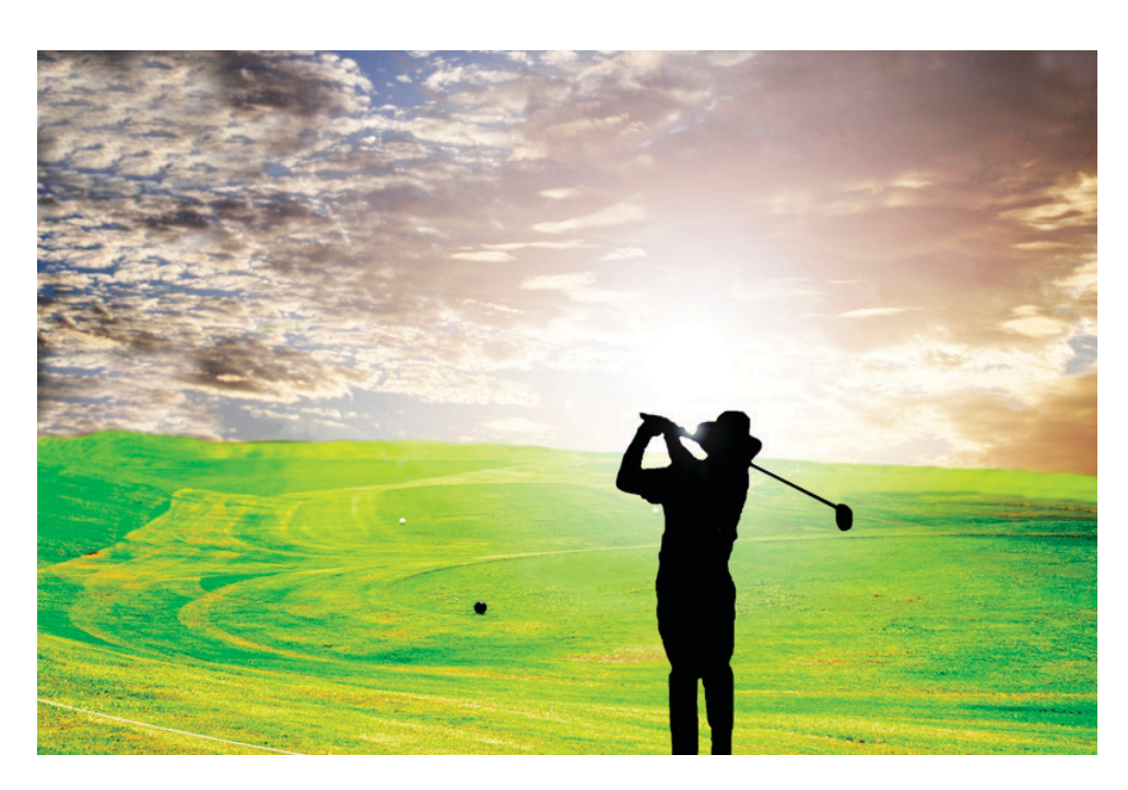
Play golf, run, and even get down on the floor with your grandchildren – painfree! All it takes is a little physical therapy magic!

Yes. We see this same scenario on a daily basis. Most sport and active injuries will subside and stop causing pain after you stop doing those activities. With physical therapy, we can detect if you are swinging your club or running improperly, or determine if you need to strengthen certain muscles while stretching others so you can golf and run pain-free. Call us today to get you headed in the right direction!